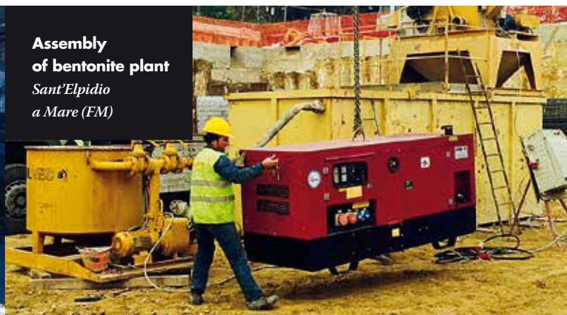
Assembly of bentonite plant Sant'Elpidio a Mare (FM)