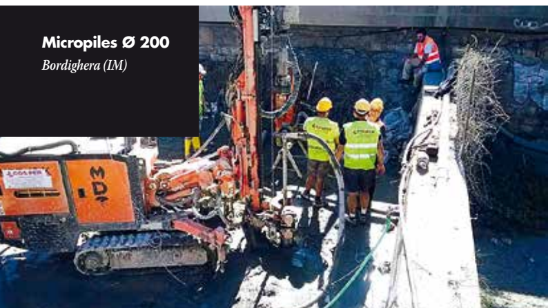
Micropiles Ø 200 Bordighera (IM)