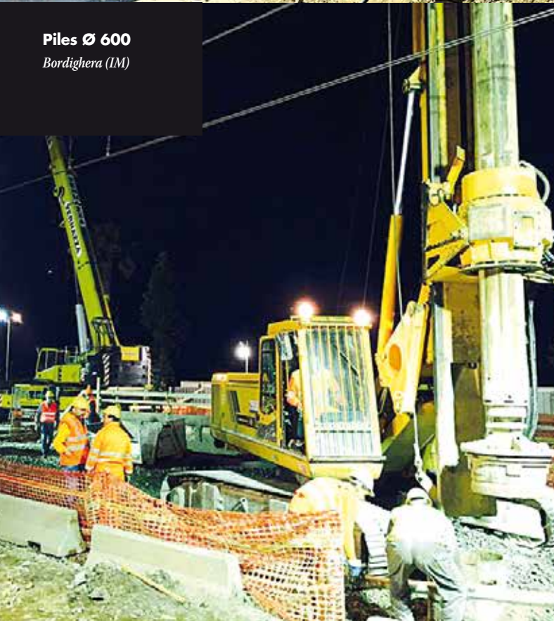
Piles Ø 600 Bordighera (IM)