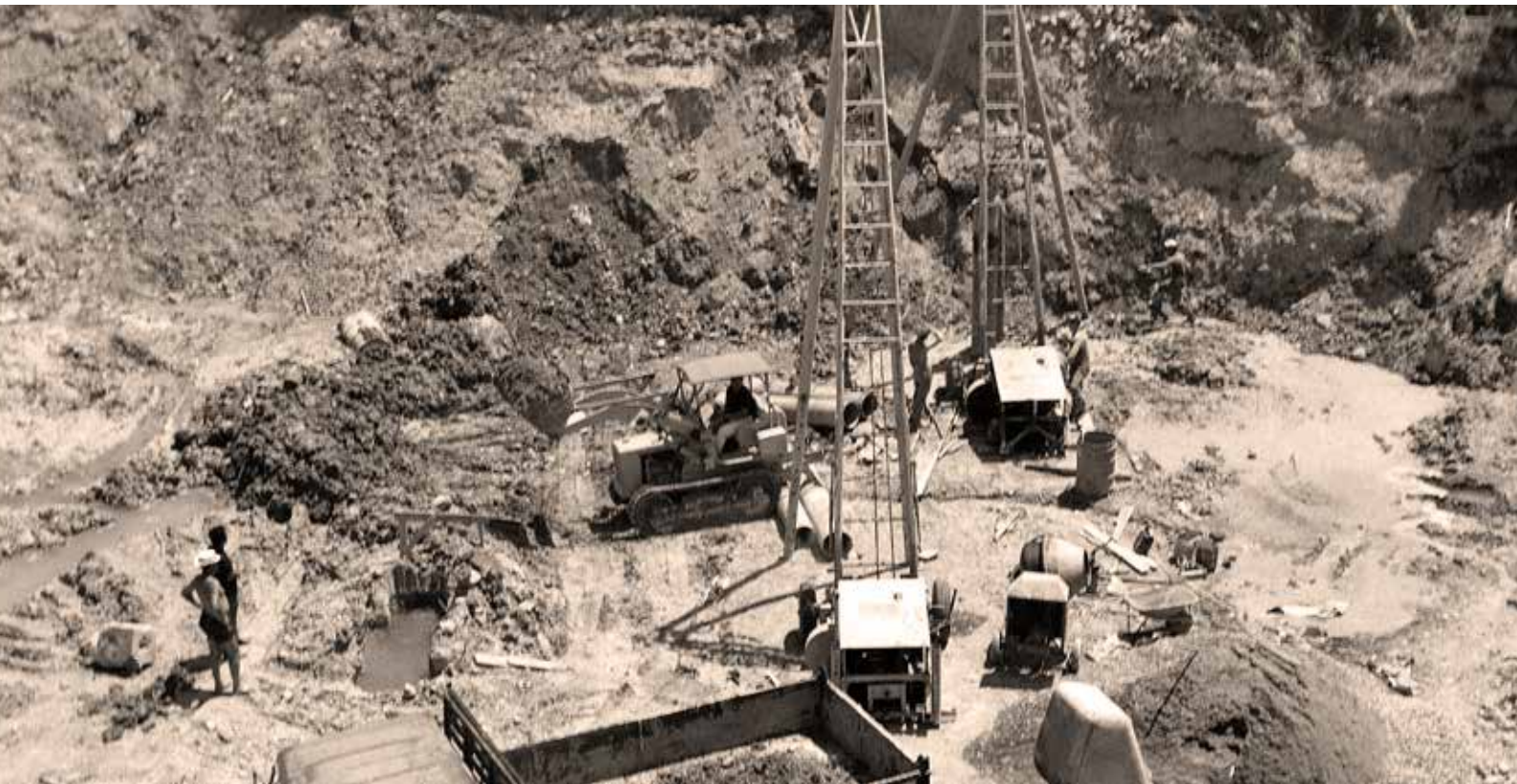
1965, Fondazioni chiesa Sant'Antonio - Fontivegge (PG)

We work hard to get the best results. By over 50 years.