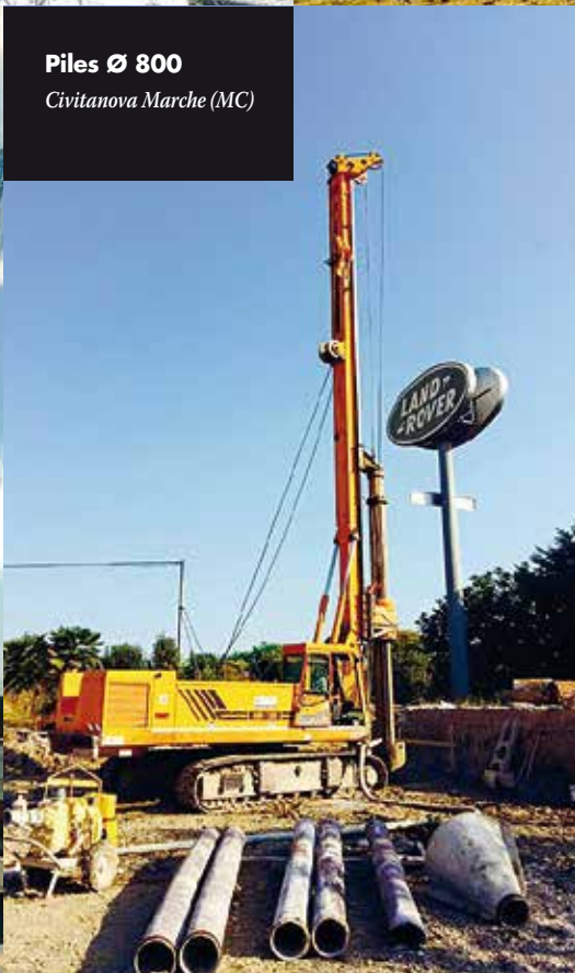
Piles Ø 800 Civitanova Marche (MC)