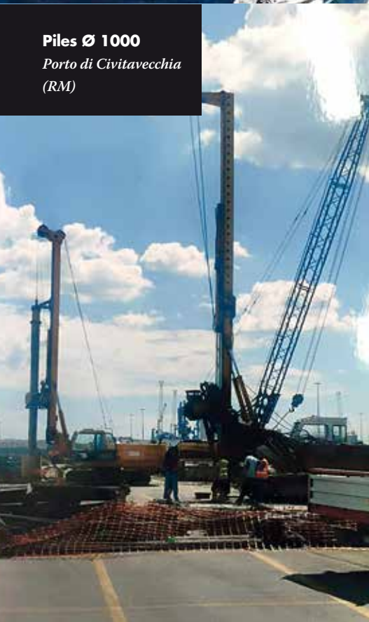
Piles Ø 1000 Porto di Civitavecchia (RM)